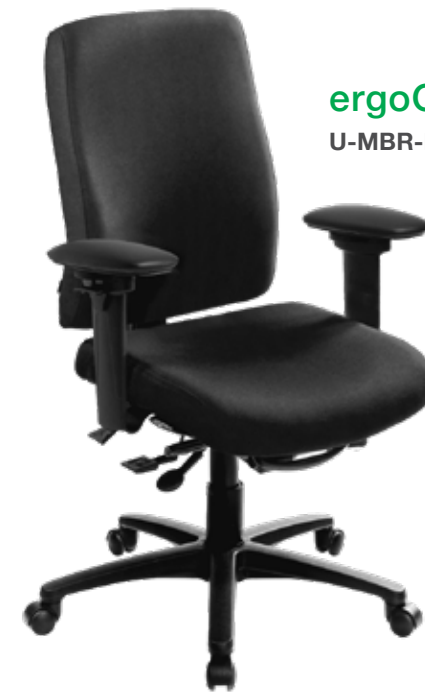
ergoCentric uCentric U-MBR-BR-U3ATA