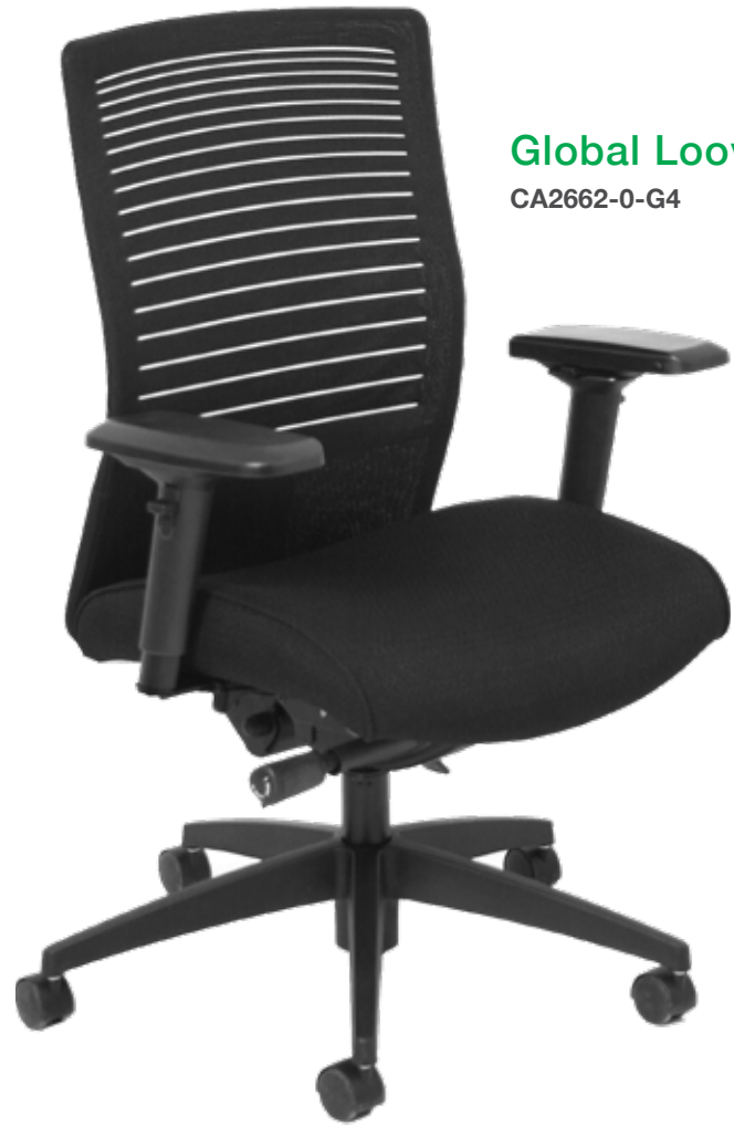
Global Loover CA2662-0-G4