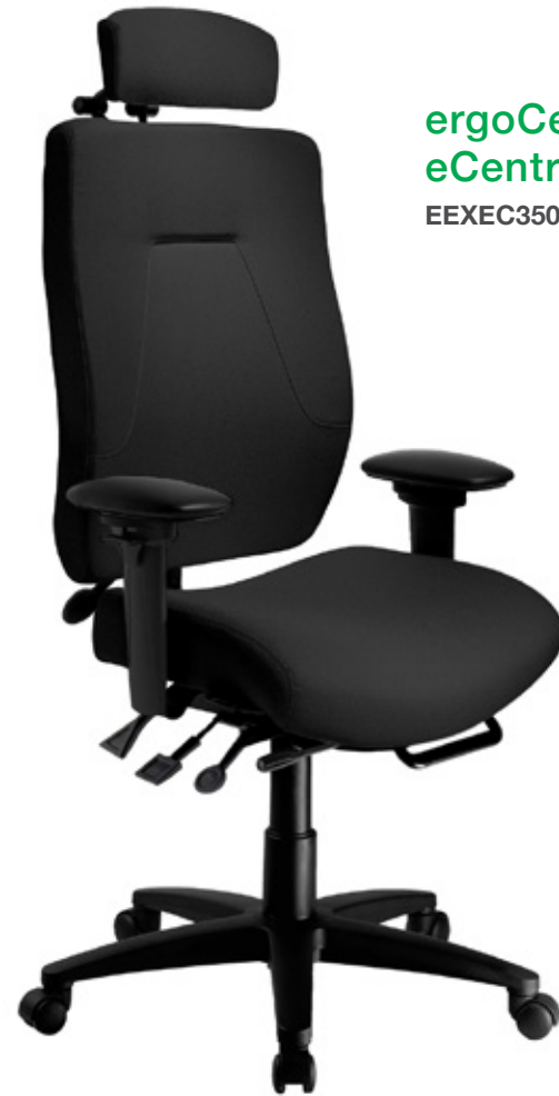
ergoCentric eCentric EEXEC350MTALHR