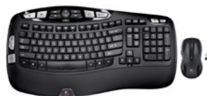
Logitech Wireless Wave Combo MK550 920-002555, SY4802885, IM77185Y, 920807 • Wireless-USB • Keyboard and Mouse Set • English