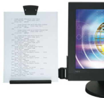
3M Flat Panel Designer Series Copyholder DH445