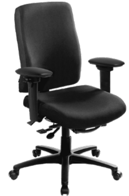
ergoCentric uCentric U-MBR-MT2-USWV