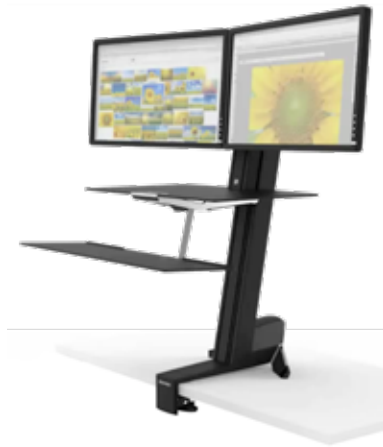
Ergotron WorkFit-S, Dual Monitor with Worksurface+ TD3831AW