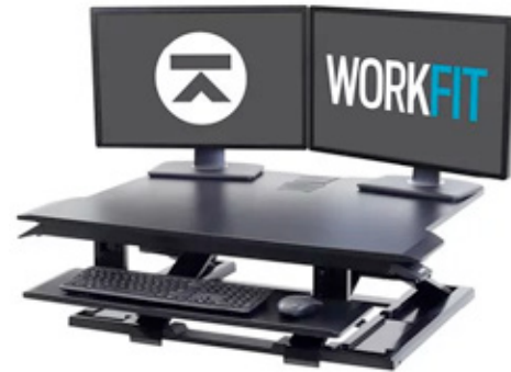
Ergotron WorkFit-TX, Standing Desk Converter TD1A5665