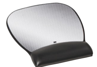
3M Large Mouse Pad with Wrist Rest MW310LE