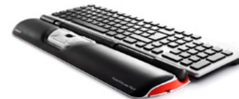
Contour RollerMouse Red Rollerbar RM-RED, SY5148287 •Wired - USB