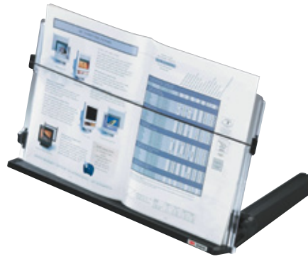
3M In-Line Document Holder DH640