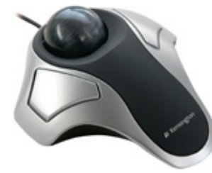
Kensington Orbit™ Optical Trackball 64327, TD741318, SY4288246 •Wired - PS/2, USB