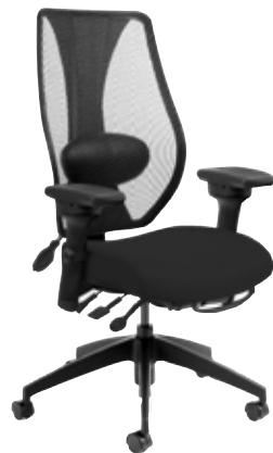
Featured on page: ergoCentric tCentric TMTLSAL360

Arm pads swivel in or out for proper ergonomic positioning. This feature comes in handy when you're trying to customize your chair to fit your specific body type or if you want good forearm support while typing at your keyboard.