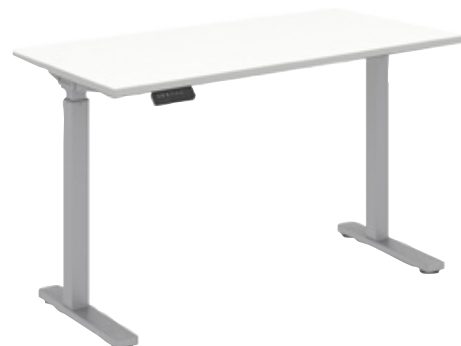
Offices to Go Ionic Electric Height Adjustable Table 46" x 23" x 28" - 45 1/4"* ML48242ACJ-DS - Acajou ML48242DWT-DS - White ML48242WCR-DS - Winter Cherry