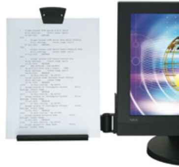
3M Flat Panel Designer Series Copyholder DH445