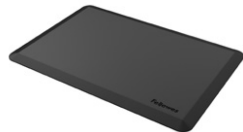
Fellowes Anti-Fatigue Wellness Mat 36" x 24" 8707002