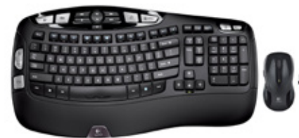
Logitech Wireless Wave Combo MK550