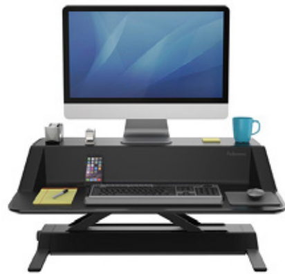
Fellowes Lotus Sit-Stand Desktop Workstation Black - 0007901 | White - 0009901