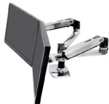
Ergotron LX Dual Side-by-Side Arm TD47959L