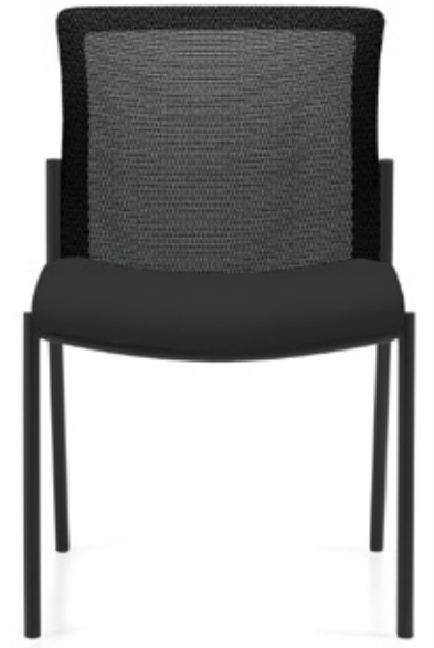
Global Vion Without Arms