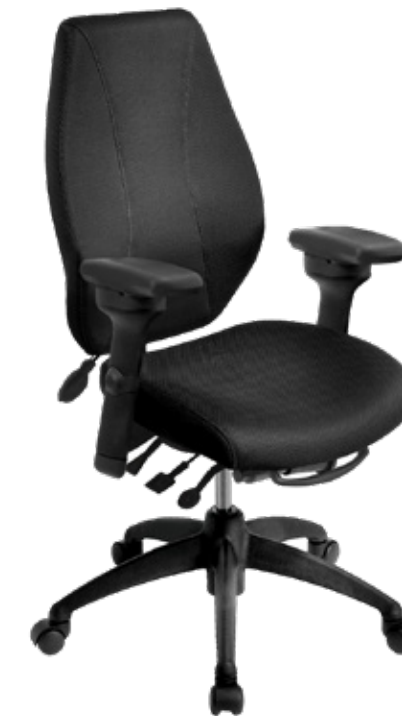
ergoCentric airCentric Without Headrest AIRMTAL360 With Headrest AIRMTAL360HR