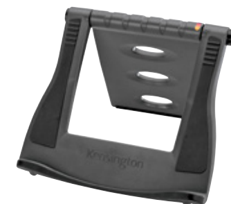
Kensington Easy Riser Notebook Cooling Stand with Smartfit System 60112