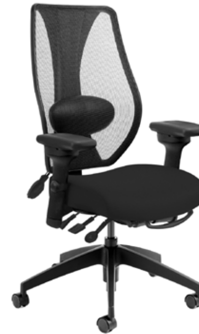
ergoCentric tCentric TMTTALSAL360