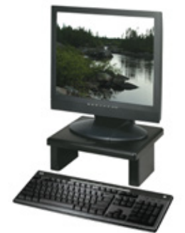
DAC Adjustable Monitor Riser MP107