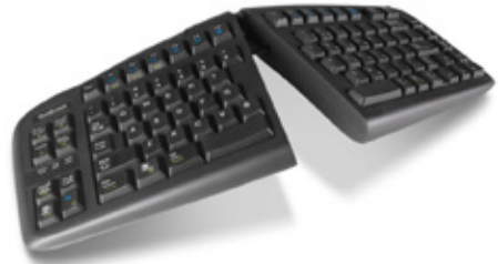
Goldtouch V2 Keyboard

Grand & Toy is also an authorized dealer for these Office Seating Supply Arrangement holders: