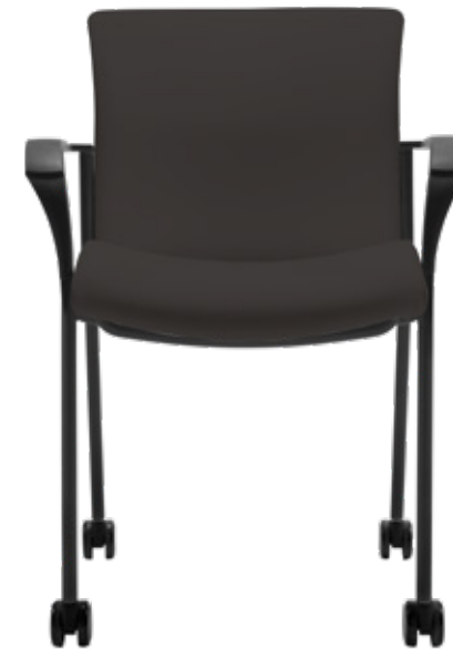
Global Vion With Arms