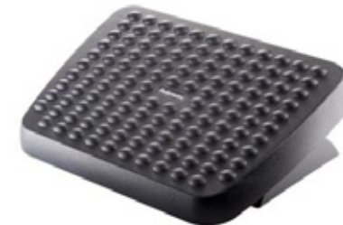
Fellowes Standard Footrest 48121-0