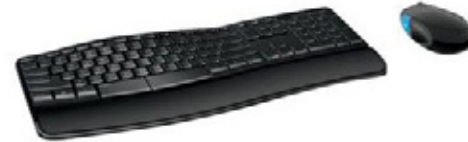
Microsoft Sculpt Comfort Desktop Keyboard and Mouse Set