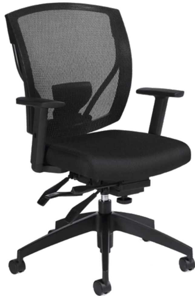
Global IBEX GCAMVL2804F-1