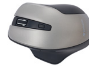
Verbatim Silent LED Mouse Graphite - 70242-1 Dark Teal - 70244-1 | Red 70243-1 •Wireless