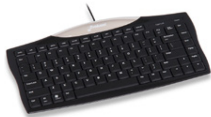
Evoluent Essentials Full Featured Compact Keyboard