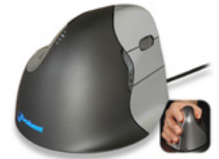
Evoluent Vertical Mouse VM4L, SY4807522 Left Handed, Wired-USB VM4R, SY4807520 Right Handed, Wired-USB VM4RW, SY4861553 Right Handed, Wireless