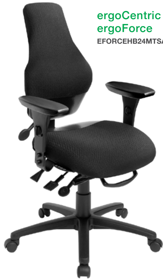
ergoCentric ergoForce EFORCEHB24MTSAA*