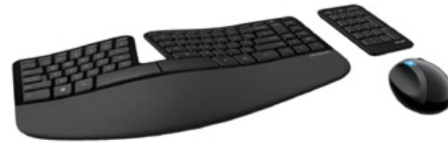
Microsoft Sculpt Ergonomic Desktop Set

L5V-00002, TD5106BW, SY5133956, IM61341U