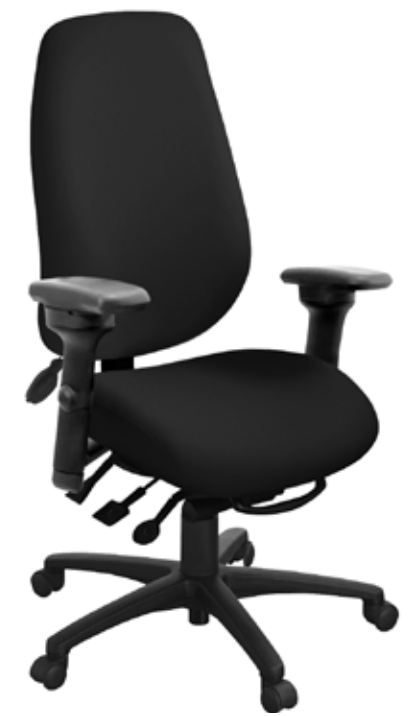
ergoCentric geoCentric Without Headrest GEOXTBMTAL360 With Headrest GEOXTBMTAL360HR

*With swing-away arms designed to accommodate duty belts. 24 hour multi shift application. Features abrasion strips on seat and back.