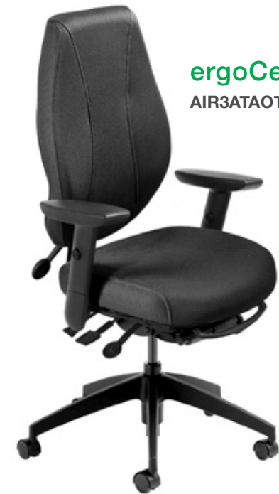
ergoCentric airCentric AIR3ATAOTUC