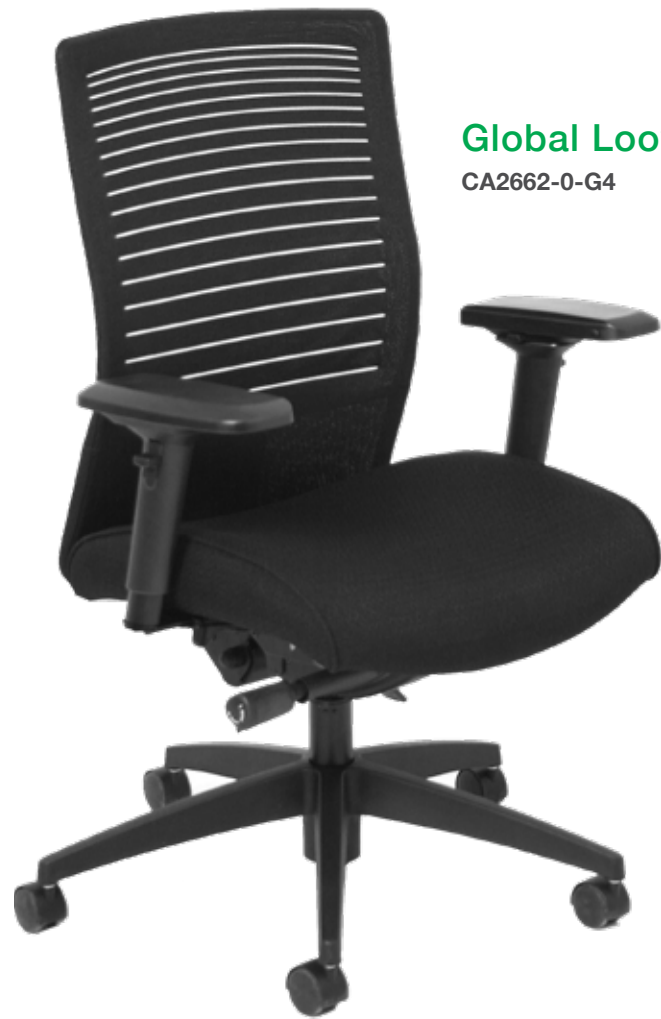
Global Loover CA2662-0-G4