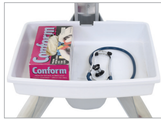
SV Front Tray