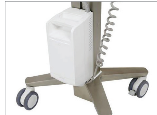
LiFeKinnex Power System