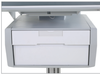
SV Primary Storage Drawer, Single Tall