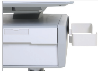
SV Sharps Container Drawer-Mount Bracket Kit