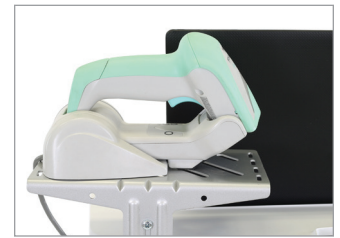
SV Scanner Shelf