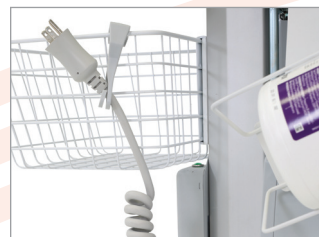
Coiled Extension Cord Accessory Kit