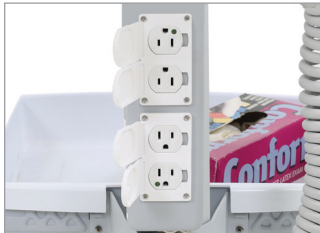
Medical-Grade Power Strip