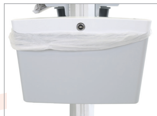
SV Storage Bin