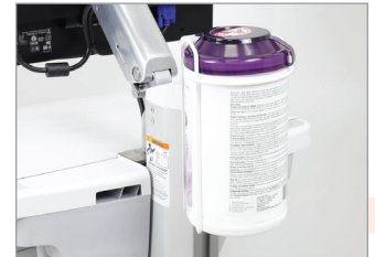
T-Slot Wipes Holder