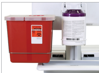
Sharps Container T-Slot Bracket Kit